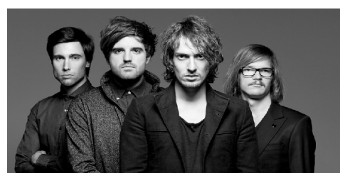
Kensington (NL) - Akvárium Klub 20. February 2017