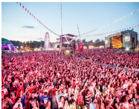
Volt Festival - Sopron 27. June - 1. July 2017

More info: http://budapestiwagnernapok.hu/eng/