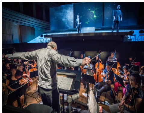
Wagner in Budapest Opera Festival 8-21. June 2017

With a decade-long history, the Wagner in Budapest Opera Festival is a source of considerable pride: over the course of the past 10 years, the "Danube's Bayreuth" has staged the complete Bayreuth Canon, i.e. all ten pieces performed on the Green Hill during the composer's lifetime. In addition to the four grandiose instalments of The Ring of the Nibelung and Parsifal, the Wagner in Budapest Opera Festival in 2017 will also stage a concert opera version of Rienzi.