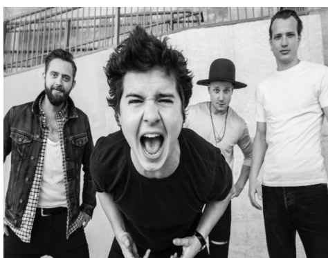
Lukas Graham 19. March 2017 - Budapest Aréna