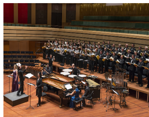
Budapest Spring Festival 31. March - 23. April 2017

More info: http://www.budapestarena.hu/program